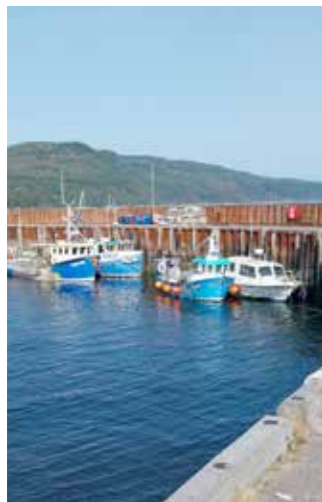
The serene scene at Carradale Harbour

“I’m continually in awe of how hard the fishing community works. Struggles with new legislation, an ageing fleet, challenges in recruiting crew, along with the sheer remoteness of this part of the country, make it so tough just getting the catch from the sea to the market”.