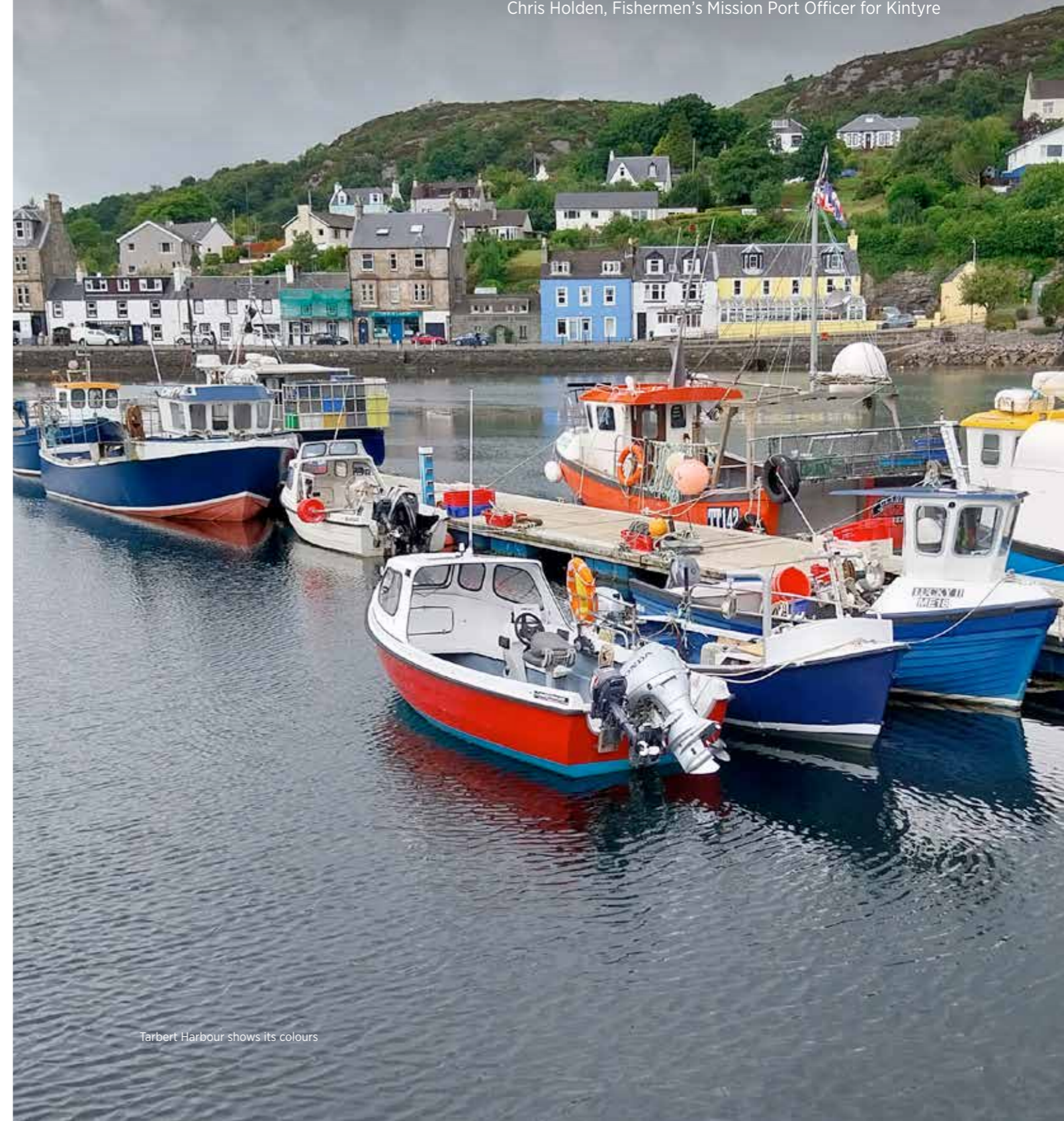
Tarbert Harbour shows its colours