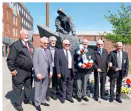
Grimsby retired fishermen remember lost crewmates

Throughout our 144-year history, the Fishermen’s Mission has shared in the highs and lows of our fishing communities - celebrating the good days but never forgetting the tragic days. Every fisherman lost is always remembered, always in our hearts.