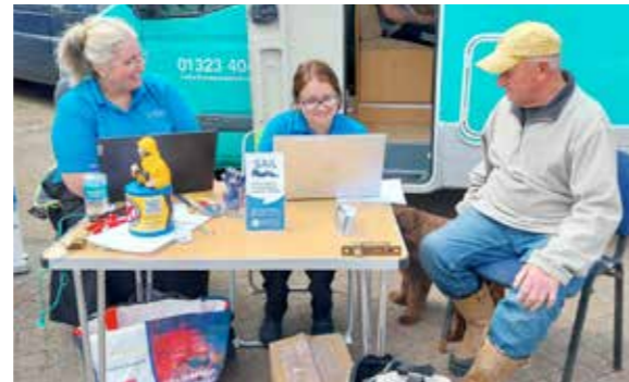
SeaFit health and dental checks

Life as a commercial fisherman is both mentally and physically demanding. Fishermen need to be on the top of their game to bring home the catch. The Fishermen’s Mission, in partnership with the Seafarers Hospital Society, gives fishermen a helping hand through award-winning SeaFit events. By taking health services directly to the quayside, SeaFit provides healthcare solutions to the marginalised in our fishing communities.