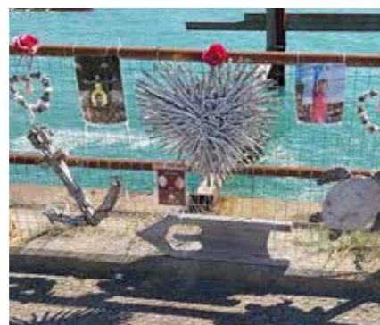
Handmade memorials to loved ones at Newhaven