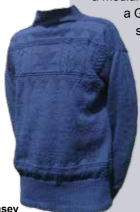
Typical Humber Gansey

A challenge to the Fishermen's Mission family... let's get knitting!