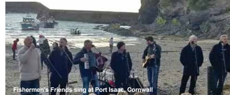
Fishermen's Friends sing at Port Isaac, Cornwall