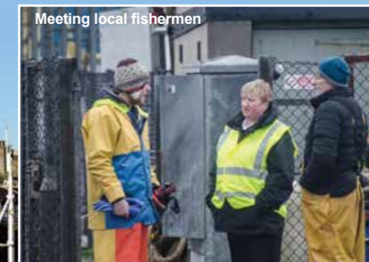
Meeting local fishermen