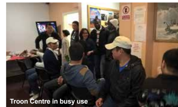
Troon Centre in busy use