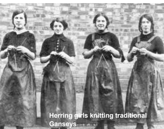
Herring girls knitting traditional Ganseys