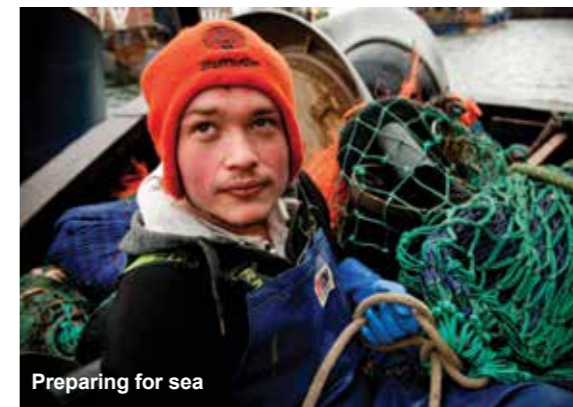
Preparing for sea

Ten years later and changes in regulations see Troon hosting a number of migrant crew from within the EU. Mainly from Latvia and Romania, they fill crew spaces on boats when local crew are not available. When in port they use the Centre and return to their boats to sleep at night. Troon Centre is also used every evening by Filipino, Ghanaian and British fishermen.