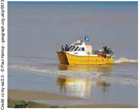
A Withernsea fishing boat returns

5th July 2020 – I can't believe it's a year today. You left a huge hole in everyone's heart. It's been hard to carry on without you most days, but we still do. The perfume of your stinky feet, crabs and lobsters are still smelling out the flat. I want to tell you how our precious little girls have grown. How proud you would be of them. Most of all, I miss you. I long for one more cuddle and talk on the balcony, one more time putting the world to rights.