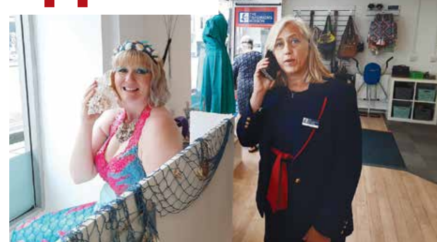
Our Cornish Mermaids calling in shoppers

"We are so excited to reopen! The new shop has vastly more space for retail with excellent storage and great office space for our South West team. We've also opened a friendly community hub for active and retired fishermen, allowing them to meet