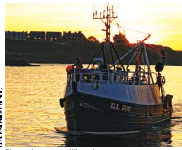
The catch returns to Ullapool

"This case left me with a mixture of emotions - sad but also satisfied that we made a really terrible situation slightly less terrible for a family that was going through such a dark time." Michael serves a vast area stretching around the top of Scotland from