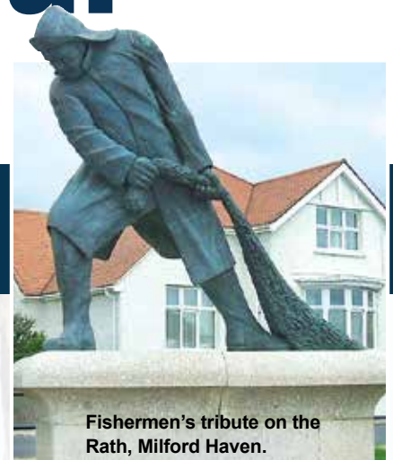
Fishermen's tribute on the Rath, Milford Haven.

the Shipwrecked Mariners' Society to help in such circumstances I have successfully appealed decisions to cut benefits through the courts. I recently spoke for a fisherman whose benefits are now reinstated with eight months' back payment made."