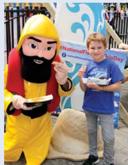
Fish & Chip fun at Trinity House

Friday 2nd June was National Fish & Chip Day 2017. Fish & Chip shops around the UK celebrated all that is great about our favourite supper. The Fishermen's Mission are proud to be the chosen charity for the event. Trinity House in London hosted one of the highlights of the day. Fish and chip shop of the year 2017 winners Kingfishers of Plymouth gave away free fish and chips in return for donations. Hundreds of people from early morning builders, city workers and tourists joined in the fun and kept our mascot Albert very busy! Special thanks to Kingfishers, NEODA (National Edible Oils Association) and Trinity House for an amazing event.