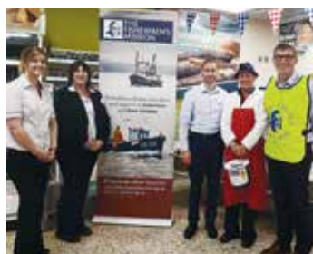
Fish Friday fun at your local Tesco!

dress and decorating their fish counters. Thank you to Tesco for your continued support.