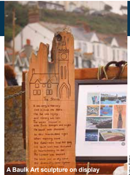
A Baulk Art sculpture on display

a real honour and cements once again the relationship between the Royal Family and the Fishermen's Mission. It was great to talk with the Royal couple about our work and for them to meet some of the volunteers involved in the Baulk Art project, a real recognition of all their hard work".