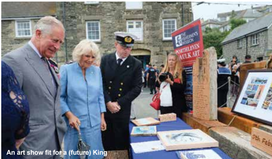
An art show fit for a (future) King