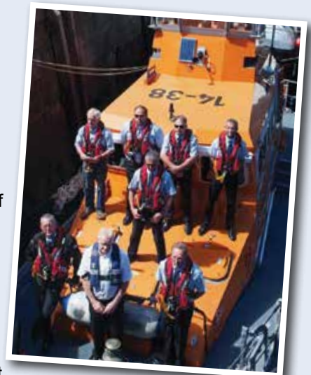
Troon Lifeboat blessed