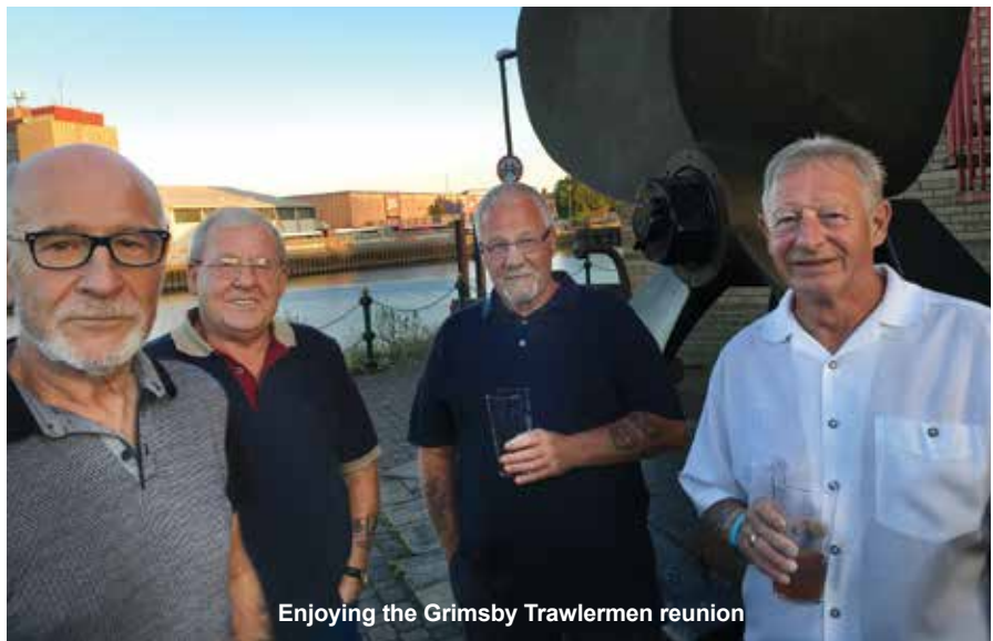
Enjoying the Grimsby Trawlermen reunion

arranging the makeover of several elderly fishermen's homes."