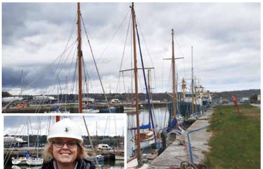
The masts and trawlers at Port Penrhyn Dock, Bangor

“There has been a sharp rise in fishing families contacting us recently. Many of the fishermen have debt problems. Working with SAIL we find that getting fishermen to put their finances down on paper and work through them is a relief. Though it is a daunting process, one fisherman told me he would now be able to sleep after simply writing down his debts.”