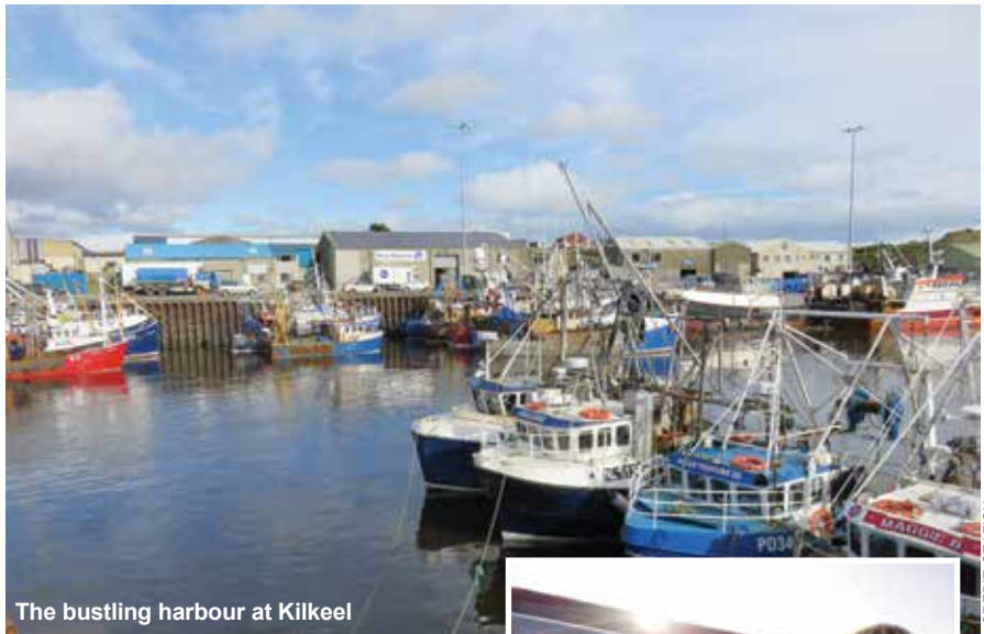
The bustling harbour at Kilkeel

"We have active and retired fishermen and their families alongside a good number of migrant fishermen who mostly come to us from the Philippines, Ghana and Sri Lanka. Our work ranges from our weekly 'catch-ups' for retired fishermen, to providing good communication links that allow our