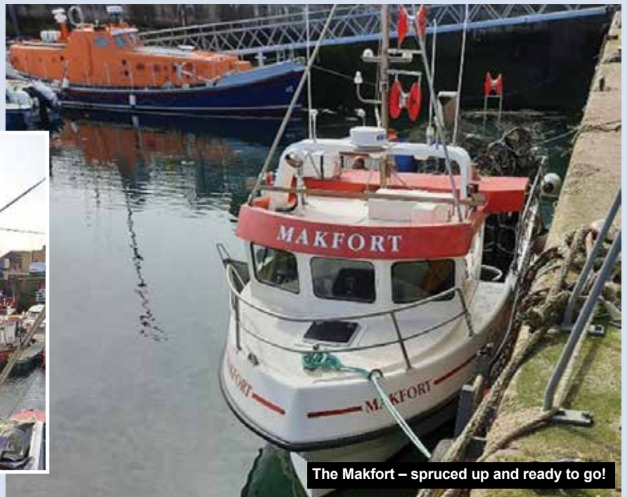
The Makfort – spruced up and ready to go!