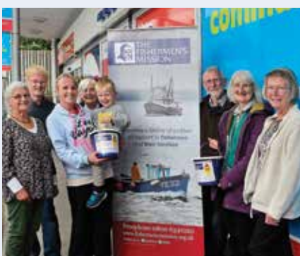
The Kirkcudbright Fish Friday heroes