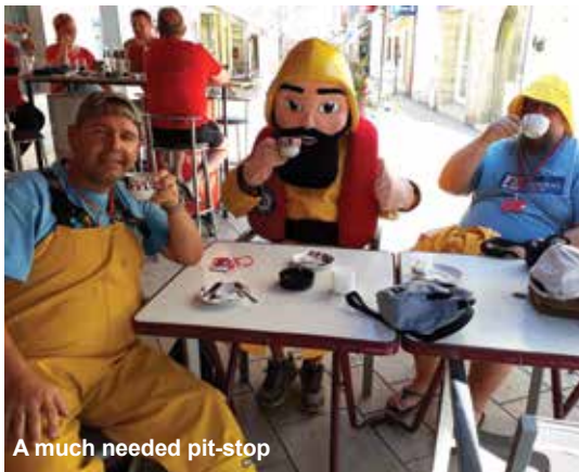
A much needed pit-stop