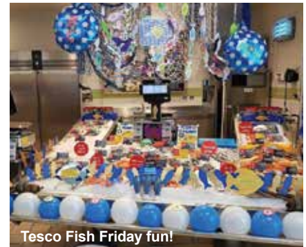
Tesco Fish Friday fun!

Money raised from Tesco stores on Fish Friday will come to the Fishermen's Mission. We are proud and delighted to have Tesco as our Fish Friday friends, a partnership that has been flourishing for many years, raising over £120,000.