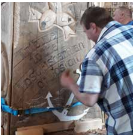
A work of remembrance in progress

"Remembering those who have gone before and caring for those who are here today is all part of the Fishermen's Mission work. I am so grateful to all our supporters who make this possible."