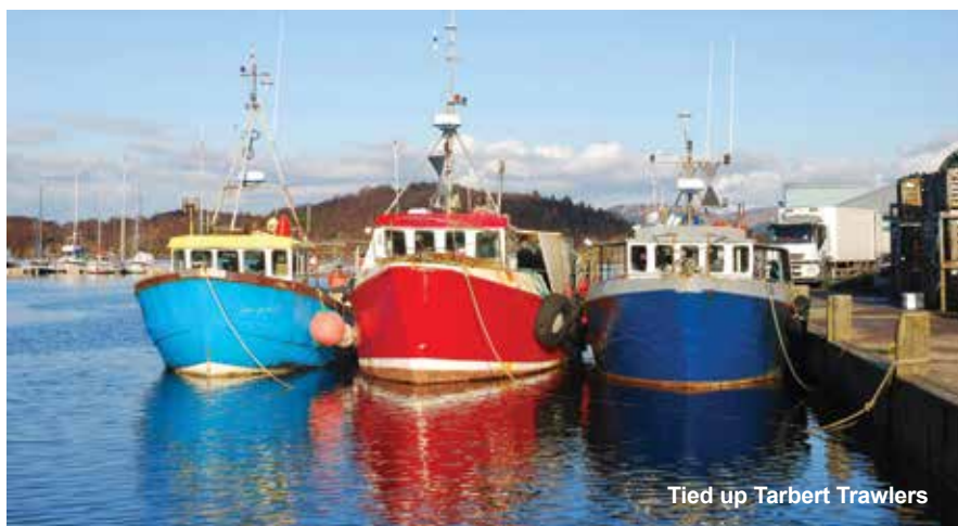
Tied up Tarbert Trawlers

On the 3rd February, following a short service, Matthew was honoured to light a candle on the harbour wall. It would stay lit until the missing boys came home. Following concerted local pressure and a fundraising campaign supported worldwide, the government agreed to raise the boat. Thankfully both bodies were found aboard. Three months on from the tragedy Matthew conducted Duncan's funeral with