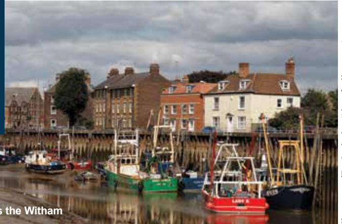
The Stump overlooks the Witham

Welcome to Boston, Lincolnshire. The River Witham flows into the tidal River Haven before completing the six-mile journey to the sea. This natural confluence has been home for fishermen for over 1,000 years. Today Boston hosts around 26 boats, landing their catch of cockles, mussels and shrimp.