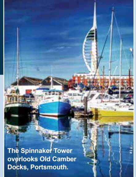
The Spinnaker Tower overlooks Old Camber Docks, Portsmouth.