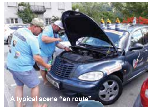
A typical scene "en route"